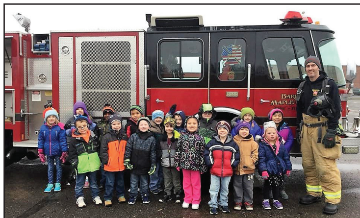
Kids Learning Fire Safety