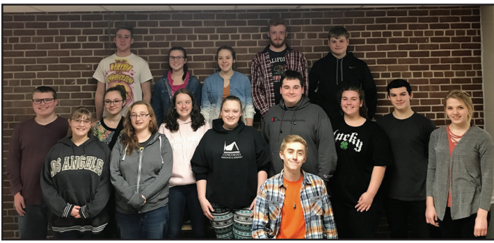
State Choral Participants