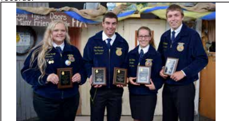
Gold rated proficiency winners

Several FFA members were recognized for their work in their SAE projects with State Proficiency Awards. To earn this recognition, members submitted detailed records about their project, including reflections on their goals and achievements, skills learned, and financial records.