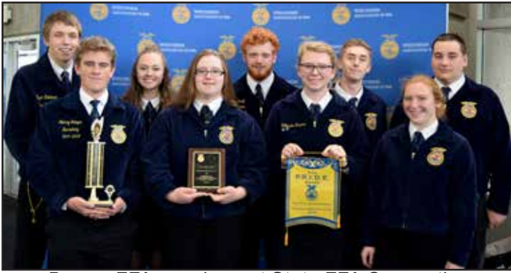
Barron FFA members at State FFA Convention