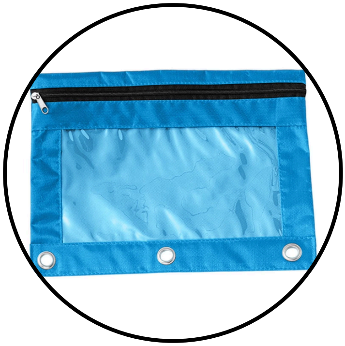
1 - Pencil Pouch (general use)