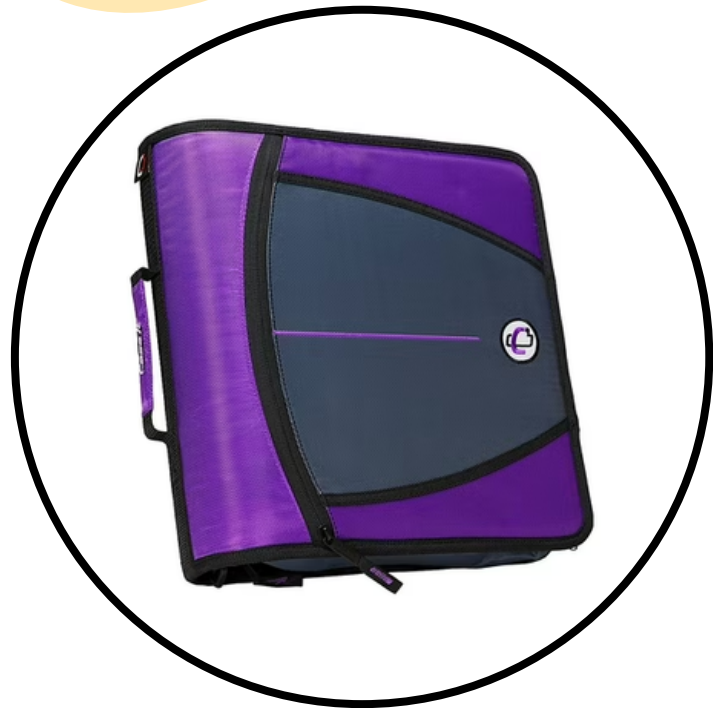
1 - Trapper Keeper or other organizer to hold folders (optional)