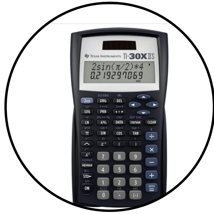
1 - Scientific Calculator ex: Casio or Texas Instrument (approximate cost: $15-$20)