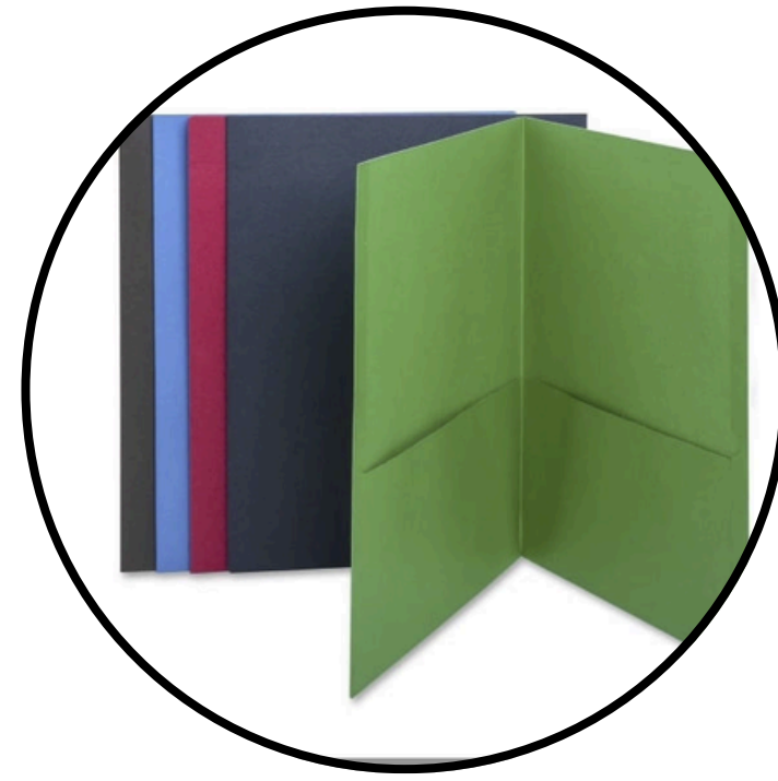
4 - Pocket Folders (for CORE areas - ELA, Math, Sci, SS)