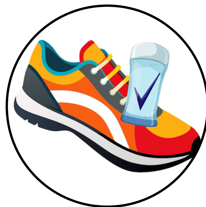
Athletic Shoes and Deodorant for PhyEd (to leave in gym locker)