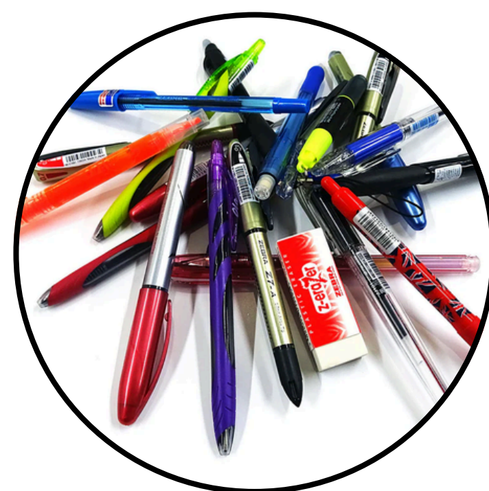
Assorted pens, pencils, erasers, highlighters