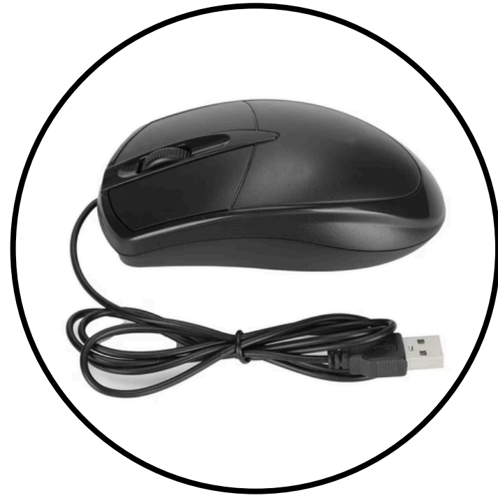
1 - WIRED mouse