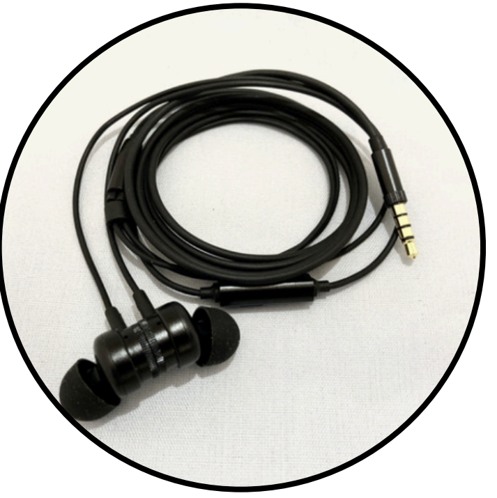
1 - WIRED headphones/earbuds