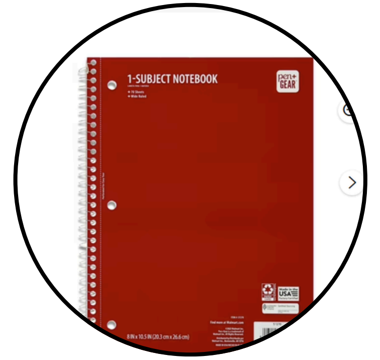
2 - Notebooks (Sci and Math)