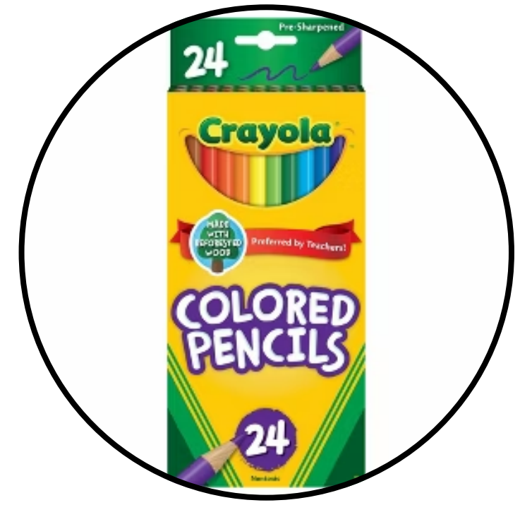
Optional: Colored Pencils for SS