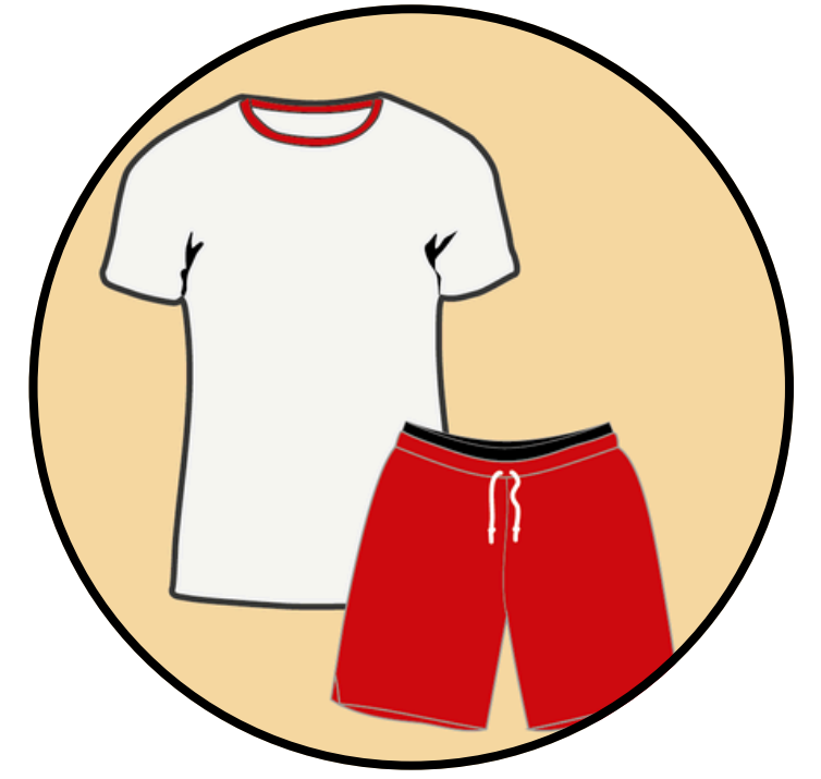
Athletic Shorts and T-Shirt for PhyEd - must conform to school dress code policy