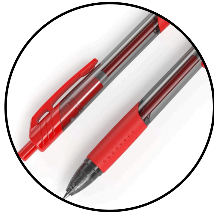
Red Pens (Math and SS)