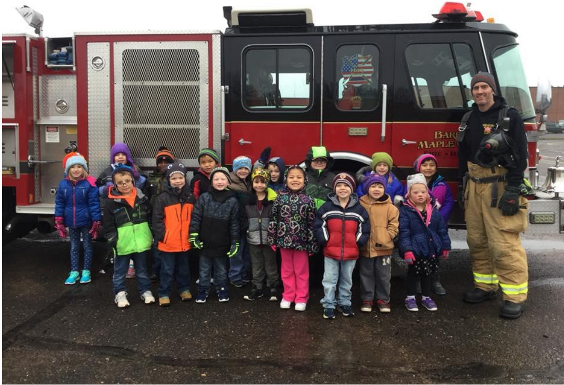
Kids Learning Fire Safety